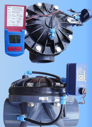
Control Flushing Valve